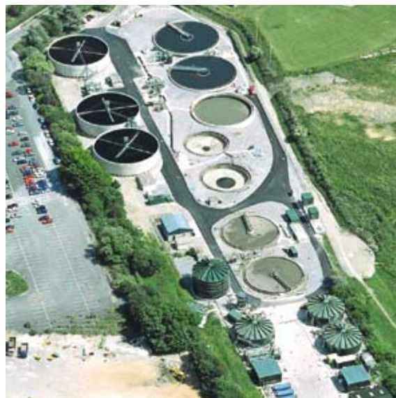
2H BIOdek® Municipal WWTP Ernesettle, Great Britain