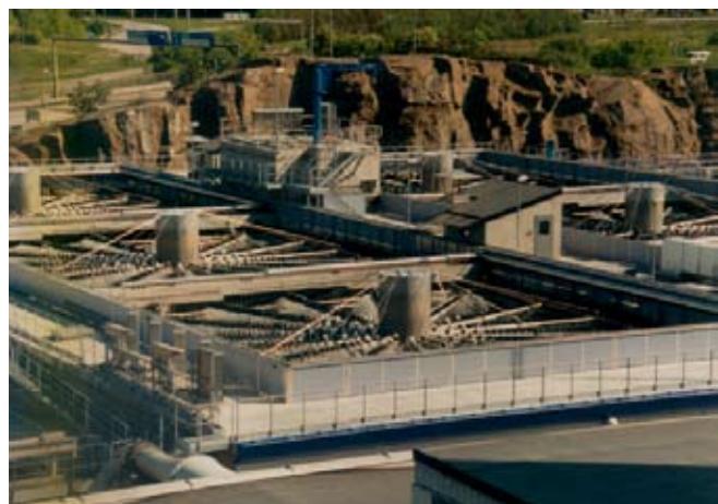
2H BIOdek® Nitrification Filters Gothenburg, Sweden